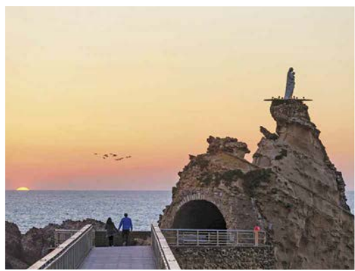
Above: Sainte-Marie Cathedral and its cloisters, Bayonne | Inset: Rocher de la Vierge, Biarritz

Discovery: San Sebastián. Known as Donostia in Basque, this sophisticated resort town dazzles with gorgeous beaches and bays and a world-class food culture. See the Old Town highlights, including the Buen Pastor Cathedral, and the many grand Belle Epoque buildings. Stroll along the boardwalk that hugs La Concha Bay and its postcard-perfect beach for incredible waterside views.