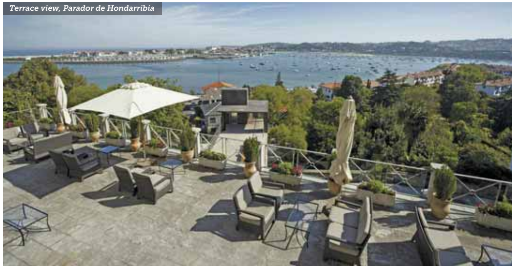
Terrace view, Parador de Hondarribia