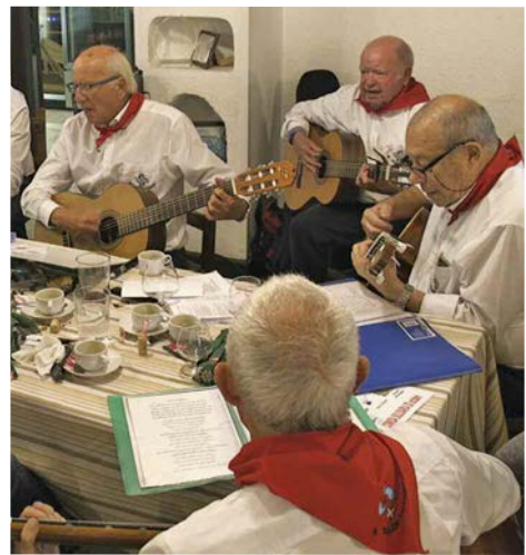
Above: Guggenheim Museum, Bilbao | Inset: Txoko, a private Basque dinner society, Hondarribia

Discovery: Bilbao and the Solomon R. Guggenheim Museum. Designed by U.S. architect Frank Gehry, this stunning, curvy museum clad in thin sheets of titanium is regarded as one of the 20th century's most important buildings. View the modern art within, then see Bilbao's landmarks on a panoramic tour with lunch afterward.